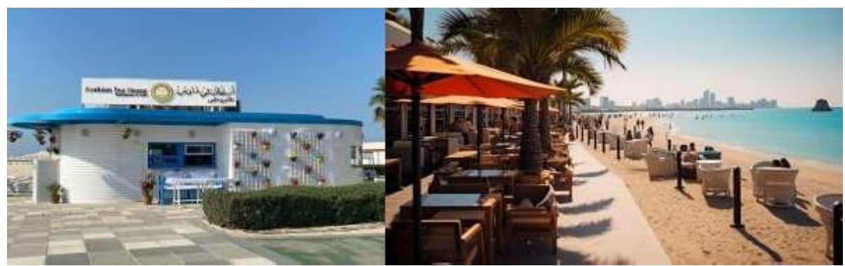
Figure 4. Jumeirah Beach Caffe

Another observation of a public space in Dubai criticized for promoting tourism is the Jumeirah Beach. This popular stretch of coastline boasts luxurious hotels, pristine beaches, and exclusive beach clubs, attracting tourists from around the world. However, locals have raised concerns about the privatization of beaches and limited access for residents, as many areas are reserved for guests of hotels or require expensive membership fees. Critics argue that this exclusivity perpetuates a divide between tourists and locals, limiting opportunities for community engagement and public enjoyment of the coastline. Additionally, there have been environmental concerns regarding the development's impact on marine ecosystems and beach erosion due to extensive construction along the shoreline.