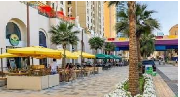
Figure 6. Ariel view of The Dubai Marina Walk