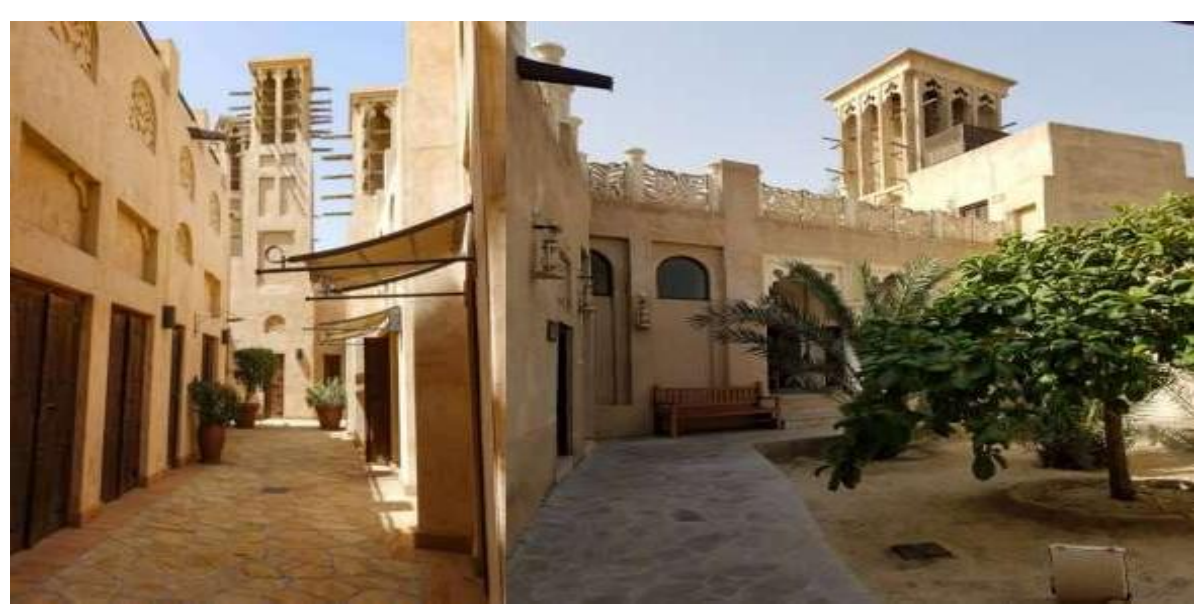
Figure 2: Basatkia known as Alfahidi-Historical Site,