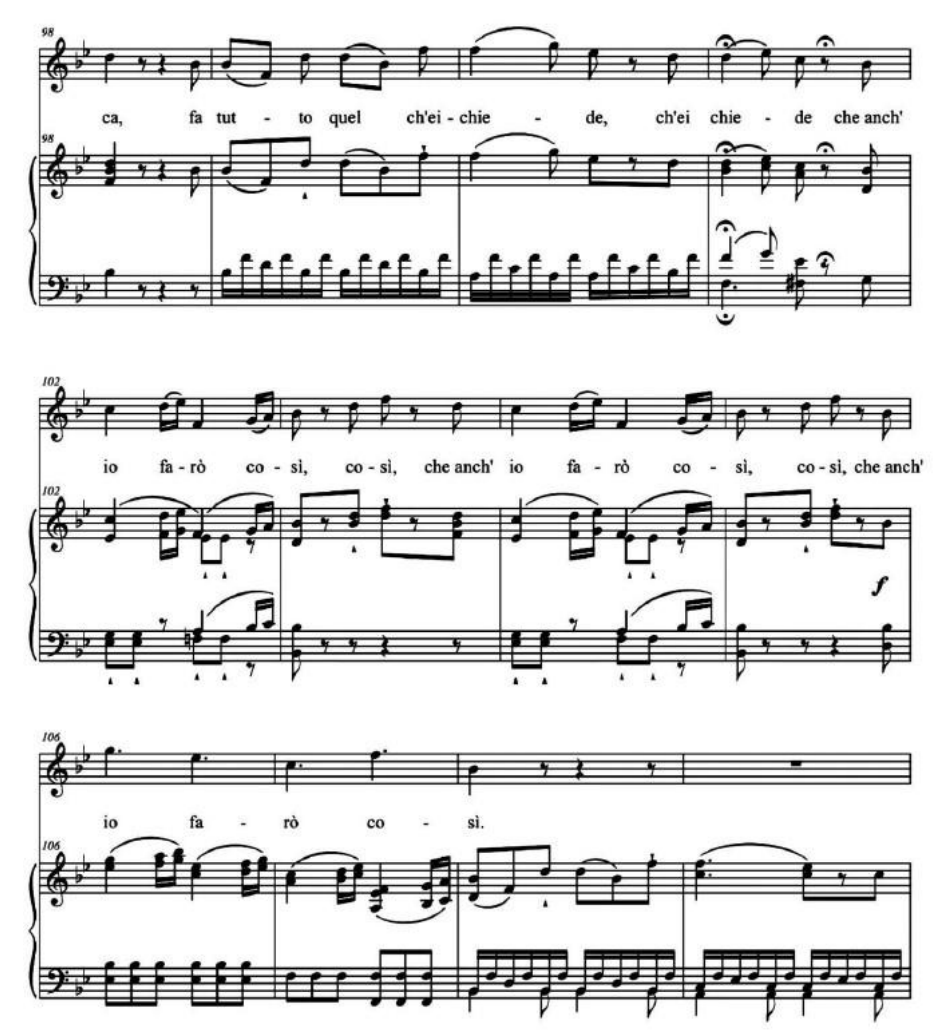
From 102-108 bars, we can conclude that the melody is mainly sung in short eighth notes and sixteenth notes, and its singing can be divided into several rhythmic combinations according to the melody and the language of the first sixteen and then eight rhythmic patterns, which requires that our voices not only show the rhythmic combinations of the sub-tempo sense of the singing but also maintain the coherence of the melodic singing.