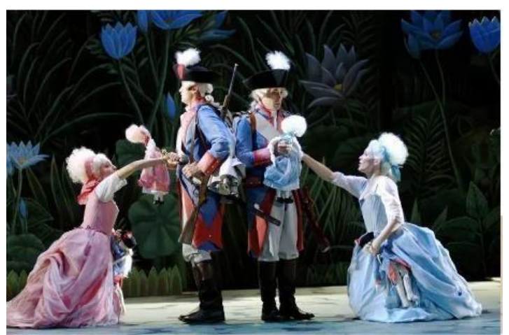
2Analysis of opera singing teaching based on vocal aesthetics

Under the background of the new era, in order to promote the further development of vocal performance, it is necessary to deeply analyze the role of modern music aesthetics in vocal performance, and explore the connection between the two as well as the effective way to combine them. Vocal performance and the theory of modern music aesthetics do not only stay at the artistic level, but also reflect the current life. Modern music aesthetics is a new theory derived from the background of continuous development of society, with certain modern characteristics[1]. The combination of vocal performance and modern music aesthetics can effectively make up for the deficiencies in traditional vocal performance, improve the effect of vocal performance, and adapt to the public demand and the development of the times. For this reason, the significance of modern music aesthetics for vocal performance should be further clarified, and on this basis, the effective combination of the two should be explored, so as to provide the necessary support for the development of vocal performance in the new era.