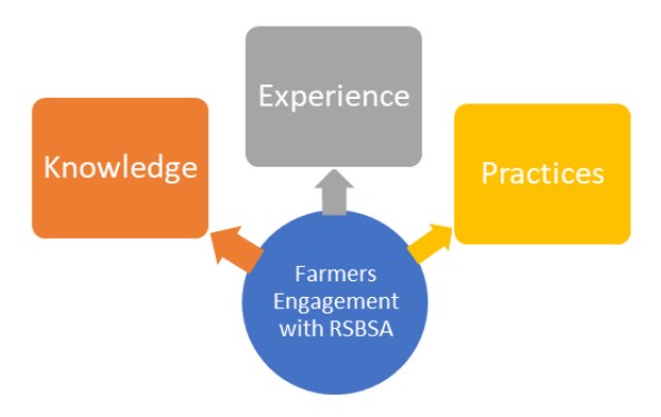
Figure 1. Conceptual Framework of the Study

AJVAZI (2015) emphasized the value of a national farmer register system for efficient subsidy processes in Kosovo. Without it, decentralized data maintenance leads to limitations in administering subsidies. Based from these literatures, this study was conceptualized as shown on Figure 1.