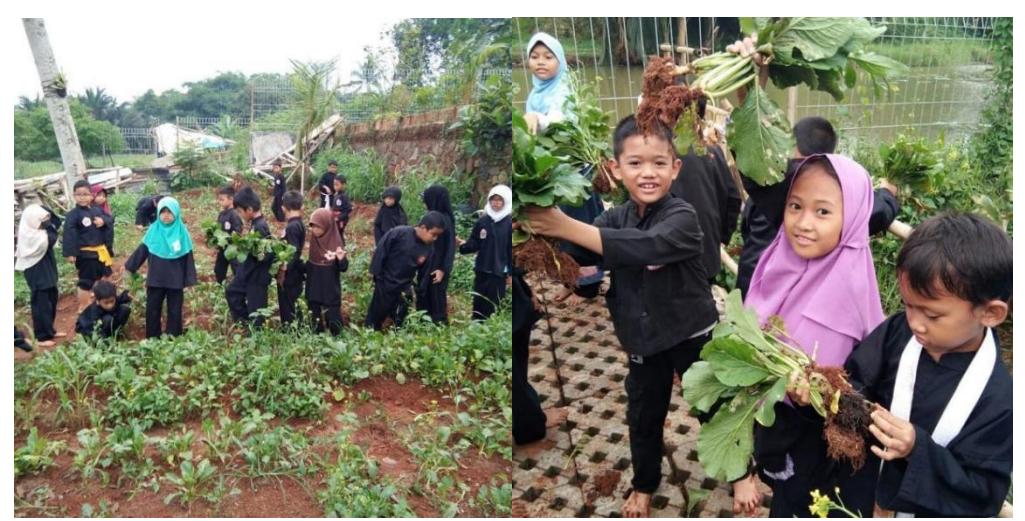
Figure 10. The students are harvesting vegetables

The third of eco-literacy hands/activity. aspect is It is shown bv planning/manufacturing/using tools for the benefit of the community, ecological knowledgebased actions, as well as the effectiveness of energy use in everyday life. In general, students have planned tools for the benefit of society. This is supported by the results of interviews with the teachers. They stated, "To plan the manufacture of useful tools that have been done several times both in the upper class and in the lower class. For example, students once made composters to help manage waste in a village they visited, while in the lower grades the tools they made were simple, such as making windmills" (Figure 10 & 11).