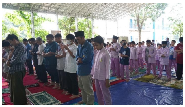
Figure 5. A congregational prayer activity

Based on the research data, it is known that spiritual habituation in schools includes activities that are carried out regularly or continuously which aim to adjust students to do good things. Habituation can be described as one of the educational methods needed to build good students' character. Good habits must be implemented in the closest environment such as the family, by parents to children without intervention. If such habituation is carried out continuously, it will certainly make good values embedded in children without being accompanied by a sense of compulsion. Such good habits will slowly crystallize and become ingrained in them so that they are reflected in their character and personality (Arti, 2018; hwan Shim, 2017; Rohana, 2019; Shim, 2017) (Figure 6).