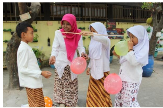
Figure 3. The students are playing traditional games