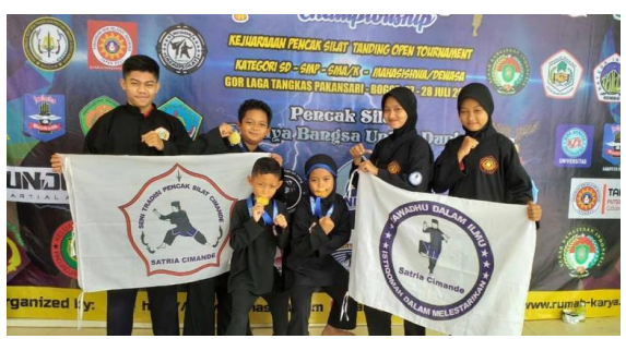
Figure 4. The extracurricular activity of Pencak Silat

The history of pencak silat initially developed from the ability of indigenous Indonesian tribes to hunt and fight using weapons of war such as machetes, shields, and spears. This discovery also corresponds to a weapon artifact from the Hindu-Buddhist era which is filled with sculptures and reliefs depicting horses, as the basic movements of pencak silat, which are also found in Borobudur Temple and Prambanan Temple (Hasibuan et al., 2022; Kuswanti et al., 2019; Siswantoyo & Kuswarsantyo, 2017). Pencak silat can provide the ability, skills, and stability to defend and defend oneself against a threat of danger, either within or coming from outside, and to ensure harmony with the natural surroundings (Hasibuan et al., 2022) (Figure 4).