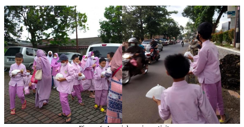
Figure 6. A social service activity

Based on the research data, it is known that spiritual habituation in schools includes activities that are carried out regularly or continuously which aim to adjust students to do good things. Habituation can be described as one of the educational methods needed to build good students' character. Good habits must be implemented in the closest environment such as the family, by parents to children without intervention. If such habituation is carried out continuously, it will certainly make good values embedded in children without being accompanied by a sense of compulsion. Such good habits will slowly crystallize and become ingrained in them so that they are reflected in their character and personality (Arti, 2018; hwan Shim, 2017; Rohana, 2019; Shim, 2017) (Figure 6).