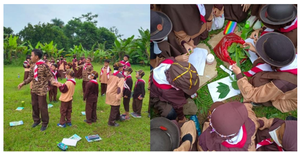
Figure 11. The students are doing an outdoor activity and camping at the same time

The last aspect is the spirit/connectional aspect which is shown by admiration for nature, expressions of praise, and a sense of comfort in nature. According to the facilitator, students often