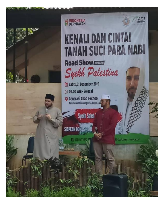
Figure 1. Students learn the culture of other countries (Arabic culture)

The global thinking ability pillar is also supported by student exchange activities abroad and study tours abroad. Several theories state that study tours or student exchanges provide new experiences related to diversity values, provide opportunities for reflection on national values and diversity from the point of view of real everyday conditions, build unity in diversity, and develop leadership skills, self-confidence, and social sensitivity (González & Stehr, 2015; Marciniak &