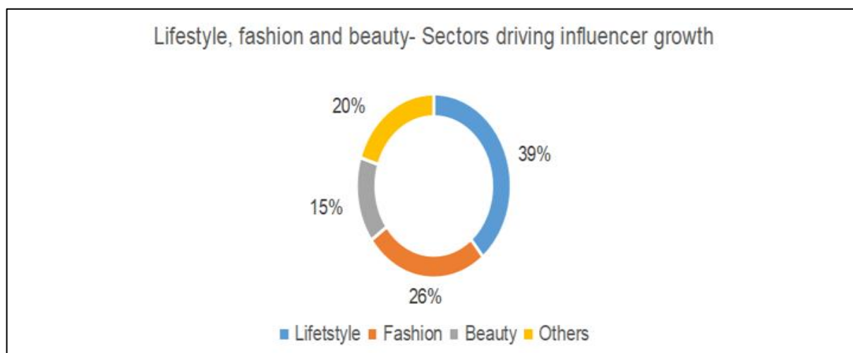
Figure 2- Future Trend in Influencer Marketing