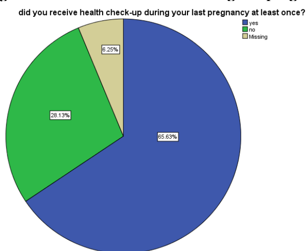
Figure 2: Health examination during last pregnancy

The above pie chart shown that 65.63% women receive health check- up during there last pregnancy at least once and 28.13% women were not goes to visit for their antenatal care. The higher percentage for visiting antenatal care is due to the increase in awareness of government schemes that are prevailing in rural areas. As in my study it is observed that there is positive attitude of women towards their health during pregnancy. Although the maximum respondents were illiterate instead of that they all were goes to their nearest primary health centre. Janani Suraksha yojana integrated better resources as well as improved the performance of health in rural setup as compared to urban areas.