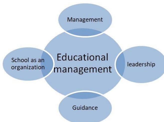
Educational management elements (Tien et al,2021).

Early in 2020, the COVID-19 pandemic broke out worldwide, posing enormous difficulties for universities around the world, including those in China. International students' access to higher education has changed significantly as a result of campus closures and travel restrictions. With a focus on enrollment management, teaching management and day-to-day operational methods, this literature review intends to investigate the effects of the COVID-19 pandemic on educational management for international students in China's postpandemic era.