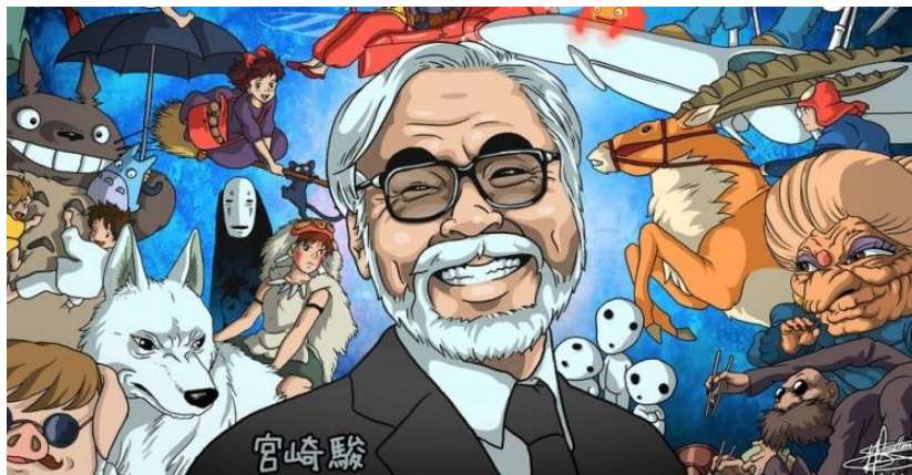
Fig 1. Hayao Miyazaki with his famous characters

everything that speaks to contemporary issues in Japanese society have made him renowned. In Japan and beyond, he is well-respected for the artwork he creates. Better to state that he is respected everywhere. It wouldn't be an exaggeration to say that he is a perfectionist in the global animation industry, even though many of his anime viewers are young. His works are intended for those who truly understand art and animation. Even though most of his anime viewers are young, it wouldn't be an exaggeration to say that he is a perfectionist in the worldwide animation industry. His creations are meant for people who understand animation and art in its truest sense. Because of his work on Spirited Away and Grave of Fireflies , among other movies, he rose to prominence as one of Japan's most talented and skilled animators. Fig 1 shows the Hayao Miyazaki with his famous characters.