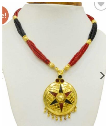
Figure-5Tar japi galpta (Star japi necklace )