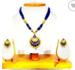
Figure-4Kerumani Necklace