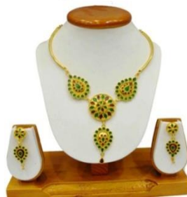
Figure-6Dugdugi and japi Designed Necklace with Earrings