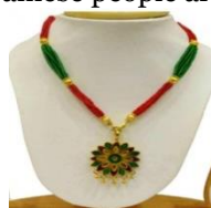
Figure-1 Sewali Necklace

Some of the extinct ornaments used by the Assamese people are given below