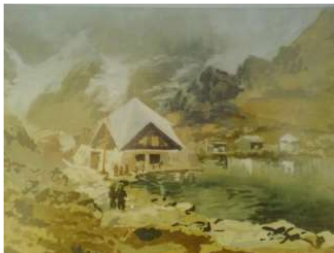
Plate No 1. Hemkund, 22x40cm, Tempera, 1982