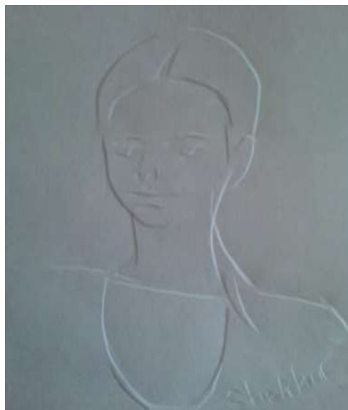
Plate No, 09. Student, Nail Drawing, 15x20 cm, 2008