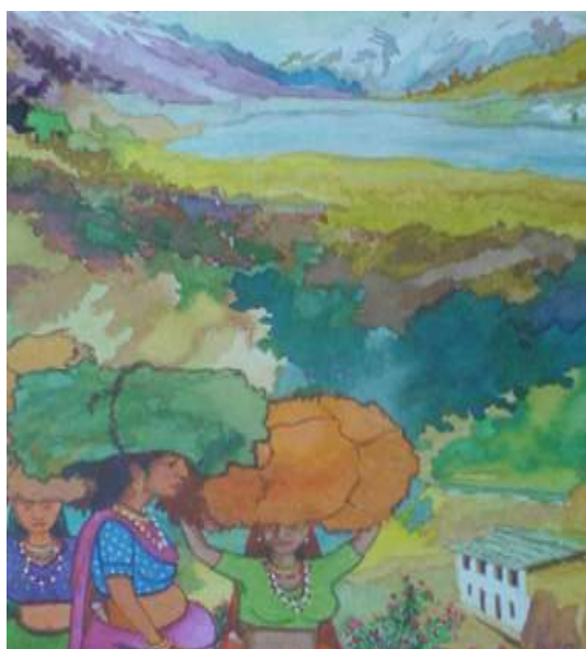
Plate No 3. Ghasiyarin, Watercolour, 16x22 cm, 1994

His early works (Plate No.1, 2, and 3.) show an awareness of the importance of negative and positive space inside the picture plane. Joshi combines a similar linearity with post- Cubist faceting of forms to depict figure, again placing the image on the surface of the canvas without any sense of illusionistic space. Only the most fundamental elements are captured in his images, which he keeps as simple as possible. Colours are sometimes reduced to just a few primary hues, which he then combines to create a seamless visual pattern. Using Indian themes and subjects, he assumes a modernist persona in his depictions of these cultures.