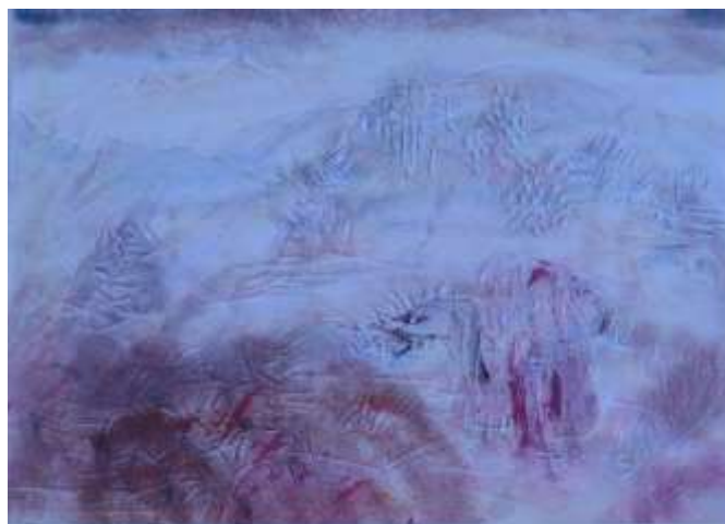
Plate No, 12. Life back to village, Finger nail and color on paper, 41x29 cm, 2020