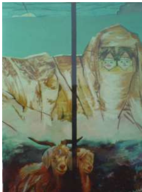
Plate No, 6, Nanda Sunanda, Oil, 6x6 ft., 2004