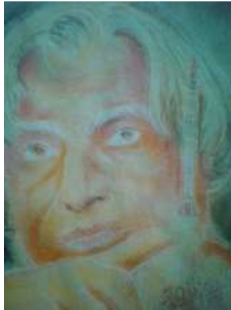
Plate No, 10.APJ Abdul Kalam. Finger nail impression on Paper, 50x40 cm, 2002.

(Plate No 10, 12) primarily utilizes the amalgamation of nail texture and alterations in the portrait to convey her emotions. His works promote the practice of deriving forms from nature and creating more refined artistic representations. By combining the use of color, line and impression ornamentation with a waves point texture, the artwork achieves a powerful and distinctive personal statement.