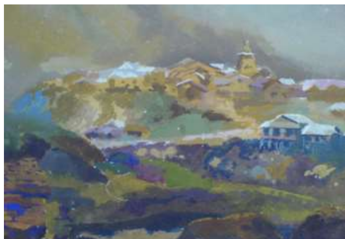
Plate No, 2. Kedarnath, 22x40cm, Tempera, 1982

His early works (Plate No.1, 2, and 3.) show an awareness of the importance of negative and positive space inside the picture plane. Joshi combines a similar linearity with post- Cubist faceting of forms to depict figure, again placing the image on the surface of the canvas without any sense of illusionistic space. Only the most fundamental elements are captured in his images, which he keeps as simple as possible. Colours are sometimes reduced to just a few primary hues, which he then combines to create a seamless visual pattern. Using Indian themes and subjects, he assumes a modernist persona in his depictions of these cultures.