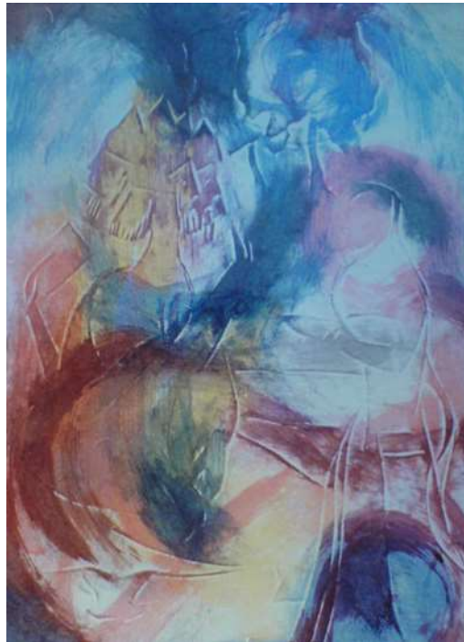
Plate No, 5, Khammaj Ragini, Nail & Watercolour, 16x22 cm, 1999

The significance that tradition plays in current Indian culture is the subject of Shekhar Joshi's artistic and intellectual endeavours in the modern day. (Plate No 04, 06) His efforts in the cross-penetration of Hindu iconography and the integration of popular, modern, classical, and Indian traditions were made possible by the reactivation of Indian visual culture, which was vital for his experiments.