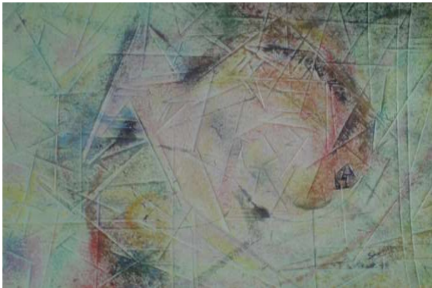
Plate No, 8 Fish in Space, Acrylic, 2x3 ft., 2008.