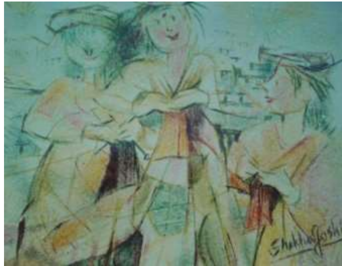
Plate No, 7 Ladies in search of fodder, Nail & Watercolour, 40x50 cm, 2005

potential for creative expression in different contexts, depending on how artists choose to utilize it. Artists can learn to express themselves more correctly and in the right context by considering different uses.