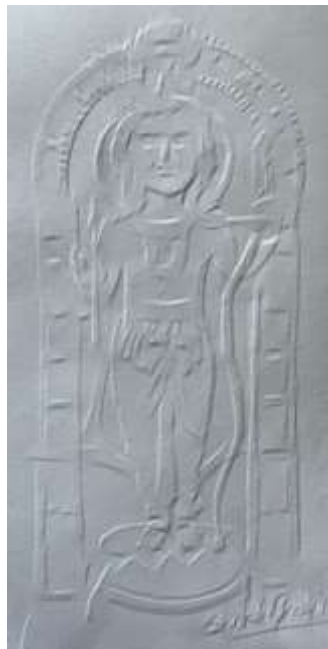
Plate No 11. Sri Ram of Aayodhya, Fingernail impression on Paper, 12x 22cm, 2024

(Plate No 10, 12) primarily utilizes the amalgamation of nail texture and alterations in the portrait to convey her emotions. His works promote the practice of deriving forms from nature and creating more refined artistic representations. By combining the use of color, line and impression ornamentation with a waves point texture, the artwork achieves a powerful and distinctive personal statement.