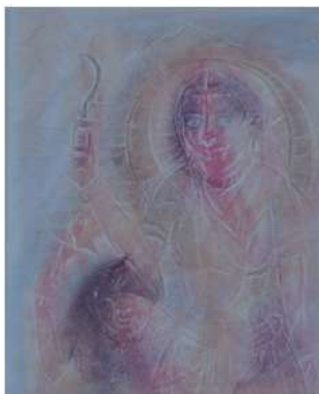
Figure no 13. Gratitude towards all Farmers, finger nail and colour on Paper, 26 21cm, 2020

Rich artistic expressions can be achieved with the texture under a variety of conditions, contingent upon how artists completely utilize it. (Plate No.8, 07 and 12) Artists can communicate emotions more correctly and in the right spot by using different purposes. Regarding the issue of using fingernail texture, it is important to consider the subjectivity, aesthetic judgment, viewpoints, and understanding of nail impression textures of the producers. Texture is highly subjective in both its application and comprehension